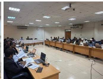
Review of Sub project proposal on RDG on 1st & 2 nd December 2025