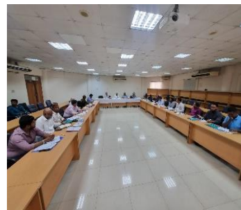
Workshop on RDG Proposal writing on & 24th September 2025