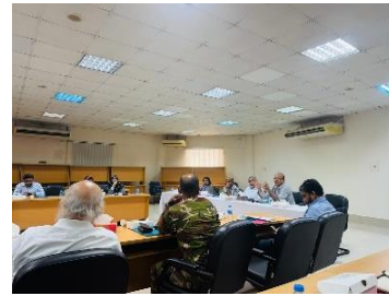
Awareness building program on RDG on 25 & 26